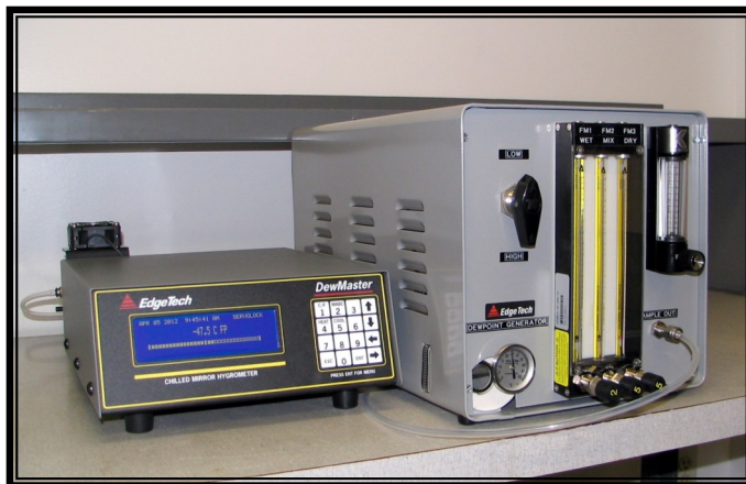
DewGen with DewMaster/S3

Input Gas Requirement: Dry gas less than 115 ppm (-40C dew point), 13 SCFH (6 liters/min), 30 to 100 psig