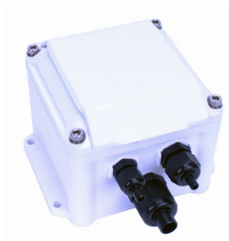
Protective Cover Closed