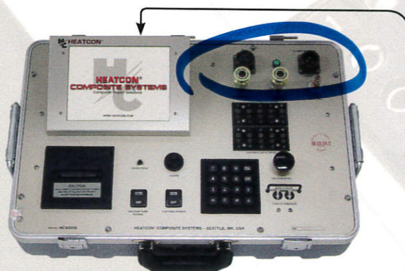
Model: HCS9000B-EV (Single Zone)