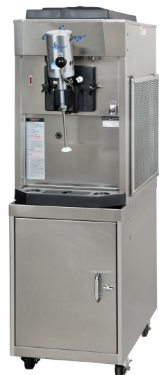
Available as a floor Standing Machine (CS700/F)