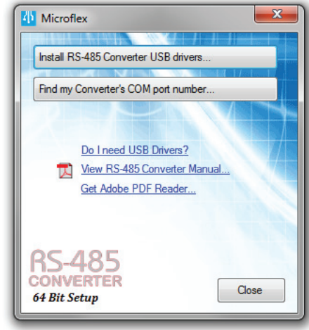
RS-485 Convert Setup Utility