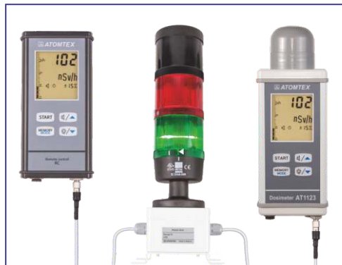
Dosimeter with external control and external alarm units

External control unit and external alarm unit can be attached to dosimeters for remote monitoring application.