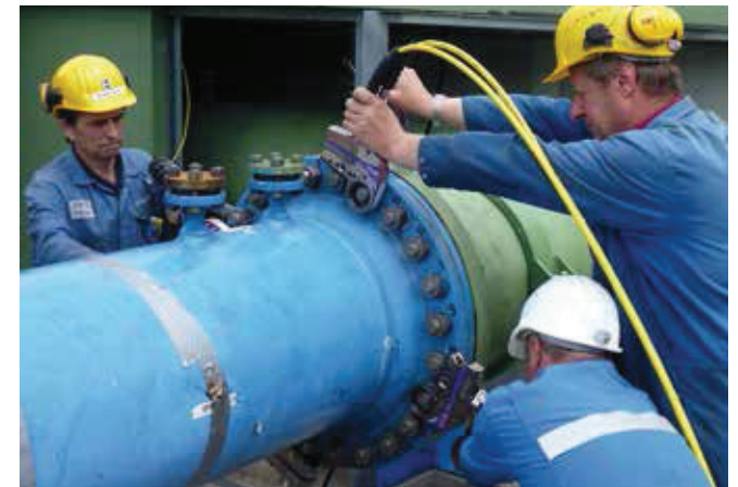
↑ SIMULTORC assembly system with Eco2Touch