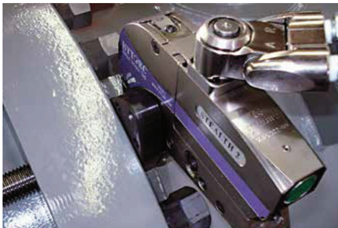
↑ STEALTH-2 with DISC washer on container cover