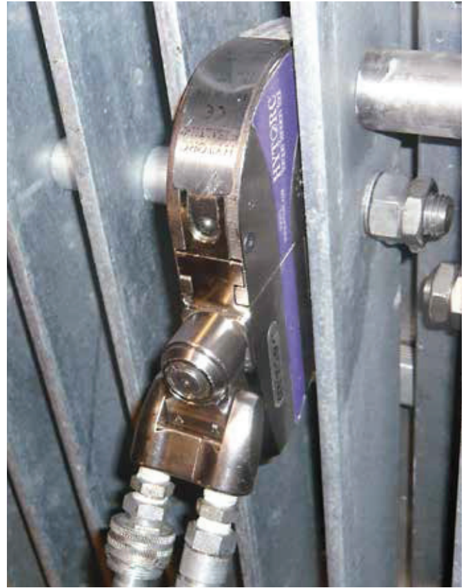
↑ The STEALTH is perfect for limited clearance bolting