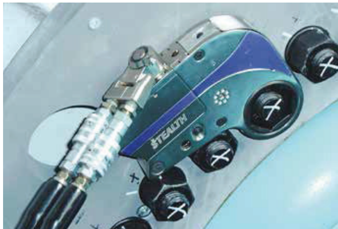
↑ Slim and fast: Application on a wind turbine