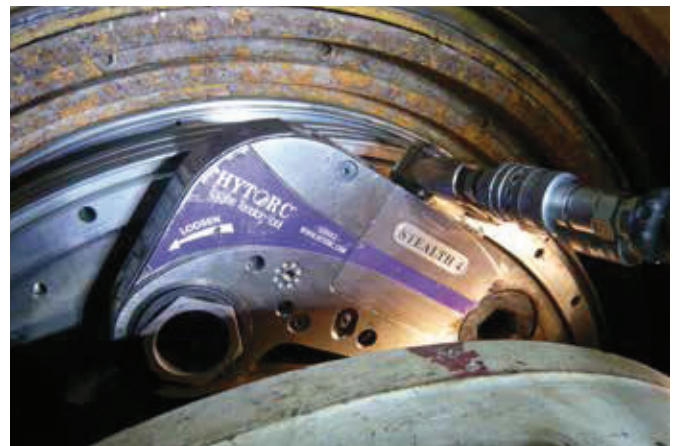
↑ The STEALTH is perfect for hexagon bolting