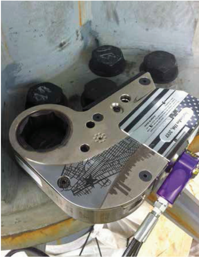
↑ STEALTH-2 in operation on the NYC Freedom Tower